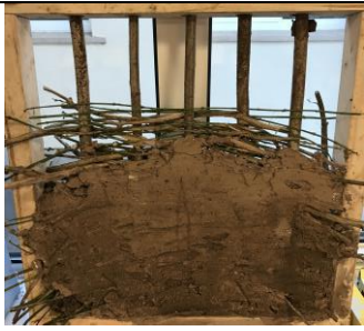
wattle and daub walls

Can you sort these pictures? Are they from 1666 or now? What clues do they give us about how and why the fire spread?