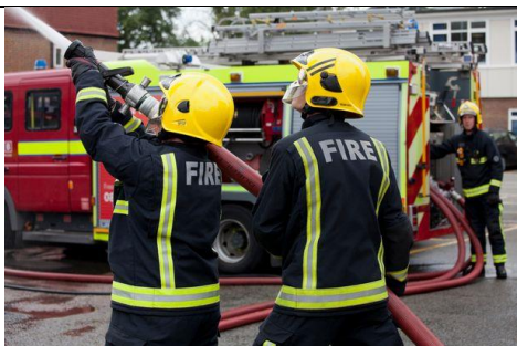
Fire engine and water hoses