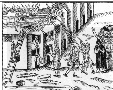
Leather buckets and fire hooks