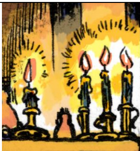
candle and holder